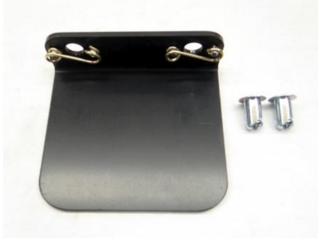
Clone Motor Aluminum Clutch Guard w/ Dzus Fasteners

Example picture available at www.Kartworks.ca - Model: PM-42CLCG